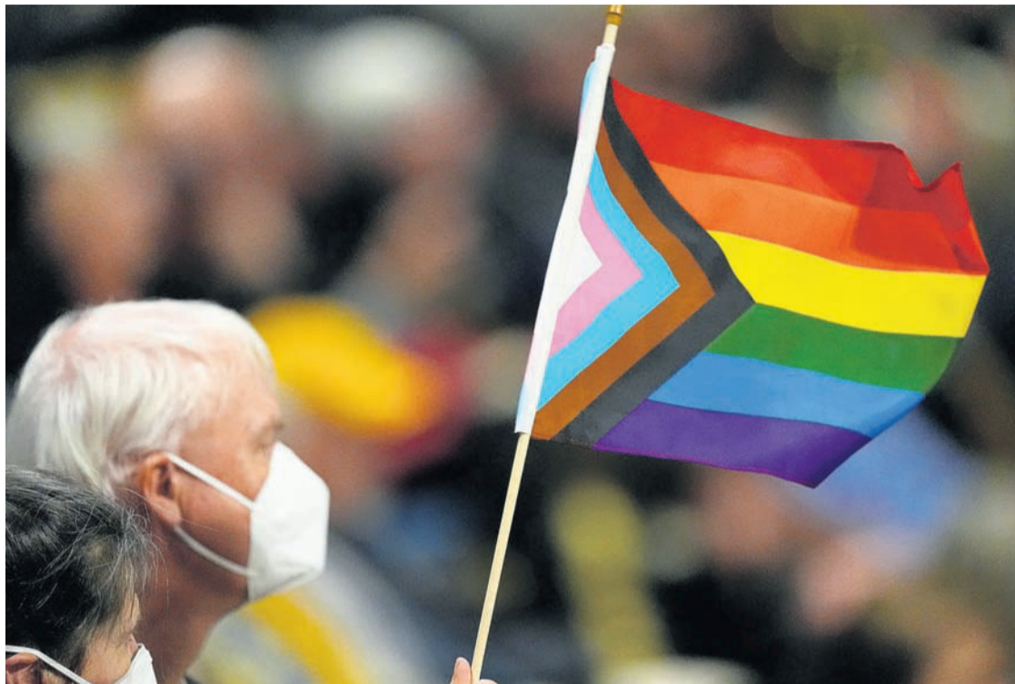
A fan holds a flag on Gay Pride night in the second half of an NCAA college basketball game, Feb. 9, 2024, in Boulder, Colo.

Many who submitted public comments said the proposed questions will provide a better understanding of the diversity of LGBTQ+ people in the